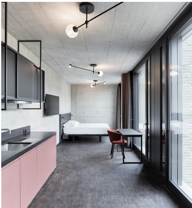
The diffuse, low-positioned luminaires create cosy islands of light that provide a relaxed ambience in the hotel rooms. The lighting is supplemented by separate reading lights on the bed head.