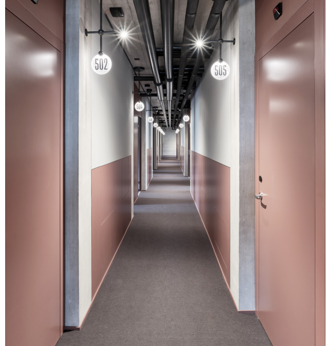
The glass room numbers in the corridors are illuminated by a downlight integrated into a metal globe.