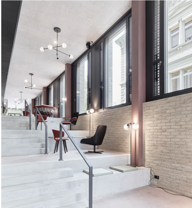
At the entrance and in the hotel lobby, glass, decorative pendant and floor lamps create a pleasant and representative atmosphere by playing with diffuse and direct light.