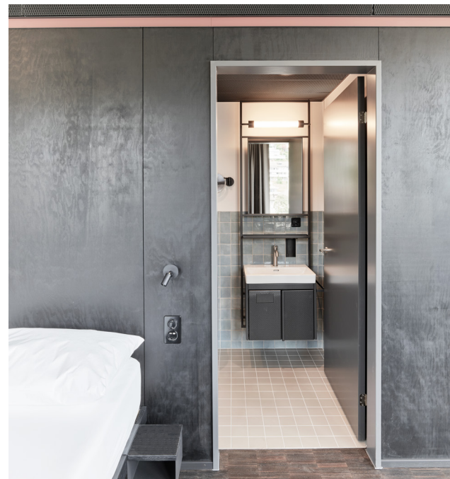
A mirror luminaire has been created to match the metal bathroom furniture specially manufactured for the project, which ensures brightness and homogeneous illumination.

You can find more references and inspiration at www.tulux.ch/produkte/inspirationen