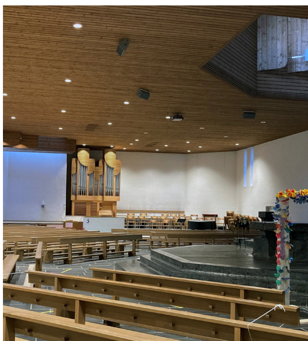
St. Niklaus Catholic Church, Hombrechtikon