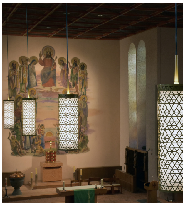
St. Leodegar Catholic Church, Birmensdorf

You can find more references and inspiration at www.tulux.ch/en/products/inspirations