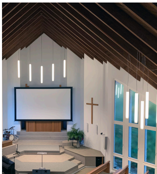
Evangelical Baptist Church, Au