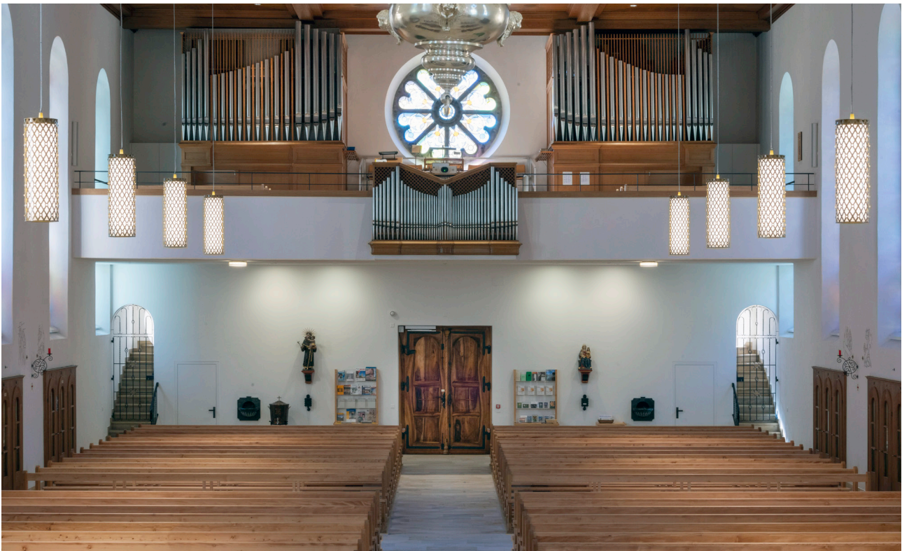
St. Ambrosius and St. Othmar Parish Church, Erstfeld

Switzerland is a country replete with churches. Many of them are heritage-listed and pose a particular challenge for architects, planners, contractors and building owners when it comes to refurbishment. Churches without protected status also require special attention, as it is important to create a harmonious interplay between the existing fabric of the building and any planned new features. When installing new church lighting – retrofitting LEDs, for instance – it is therefore worth getting the lighting company involved at an early stage. This ensures that the requirements of all stakeholders can be coordinated to best possible effect from the very start.