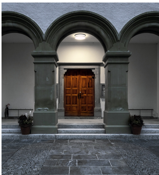
St. Ambrosius and St. Othmar Parish Church, Erstfeld